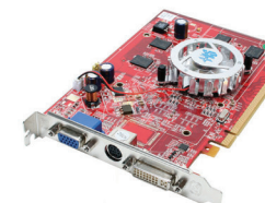
X1550PCie_iFan_Card_ 512MB PCIE