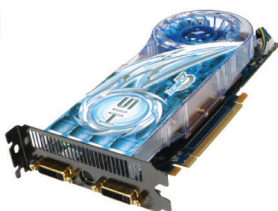
HIS HD 3870 IceQ 3 PCIE