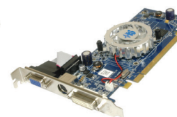
HIS HD 2400 PRO 256MB PCIE