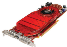
HIS HD 3850 HDMI Dual DL PCIE