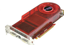
HIS HD 4870 HDMI 512MB PCIE