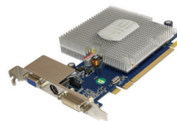
HIS HD 3450 Silence PCIE