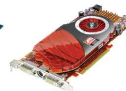
HIS HD 4850 HDMI 512MB PCIE