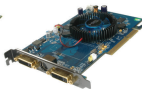
HIS HD 2600PRO Fan Dual DL AGP