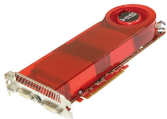
HIS HD 3870X2 HDMI Dual DL PCIE