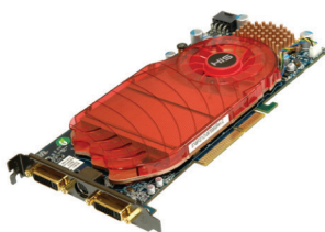
HIS HD 3850 AGP