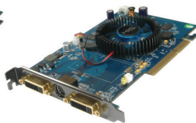
HIS HD 2600XT Fan 512MB AGP