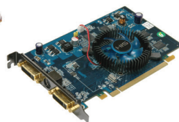
HIS HD 3650 iCooler II PCIE